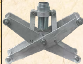
PN: 101-1310 CENTERING CARRIAGE (SHOWN INSTALLED) ADJUSTABLE, FOR 5" TO 12" ID PIPE

Can blast as small as 2" ID pipe without collars or carriage, and features a 1/2" nozzle