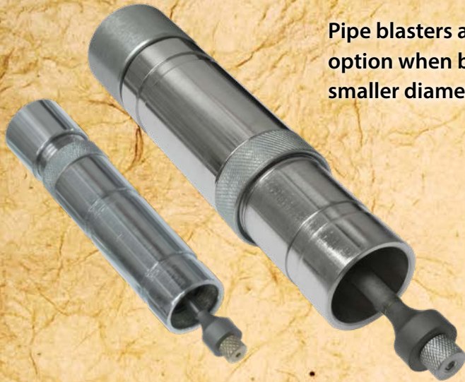
SMALL PIPE BLASTER For 13/16" - 2" ID Pipe

Pipe blasters are a great option when blasting smaller diameter pipes.