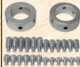
PN: 101-1240 CENTERING COLLAR SET (SHOWN INSTALLED) LARGE PIPE BLASTER, FOR 3" TO 5" ID PIPE