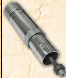
PN: 101-0760 LARGE PIPE BLASTER

Can blast as small as 2" ID pipe without collars or carriage, and features a 1/2" nozzle